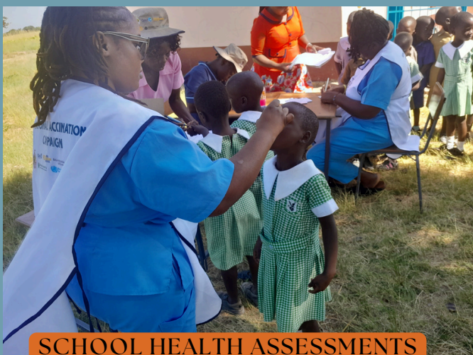
SCHOOL HEALTH ASSESSMENTS

ISALs -During the quarter (Jan- March 2024), JF Kapnek Zimbabwe, with the assistance of the Oak Foundation, conducted various activities in Mhondoro-Ngezi. They piloted parenting activities combined with Internal Savings and Lending Schemes (ISALs) in five schools. This pilot project led to the expansion of the program to 20 additional schools, where parenting and ISALs are now being implemented. ISALs aim to enhance the economic status of parents with Early Childhood Development (ECD) children in the selected schools, enabling them to use a self-managed savings-based financial service without external donations or borrowing. By increasing household income, ISALs help families better afford their children's education expenses.