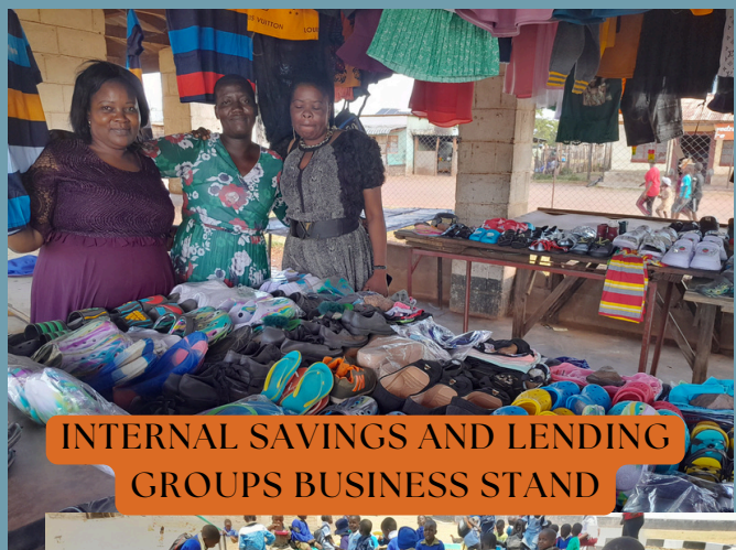
INTERNAL SAVINGS AND LENDING GROUPS BUSINESS STAND