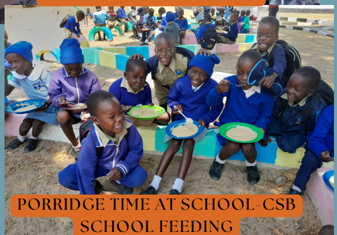
PORRIDGE TIME AT SCHOOL-CSB SCHOOL FEEDING