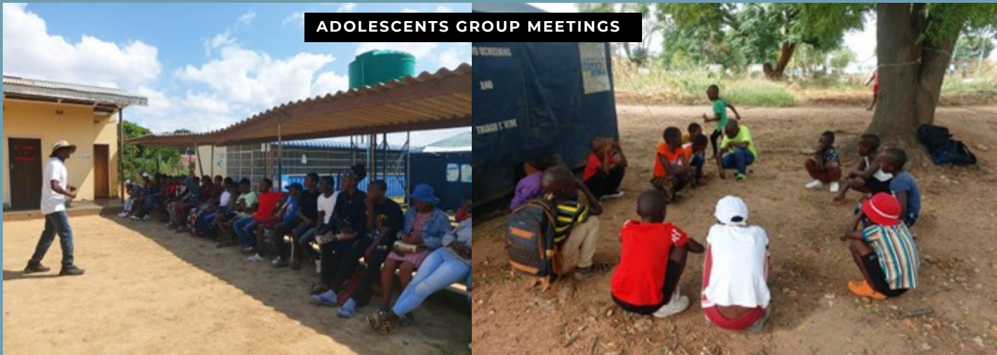
ADOLESCENTS GROUP MEETINGS